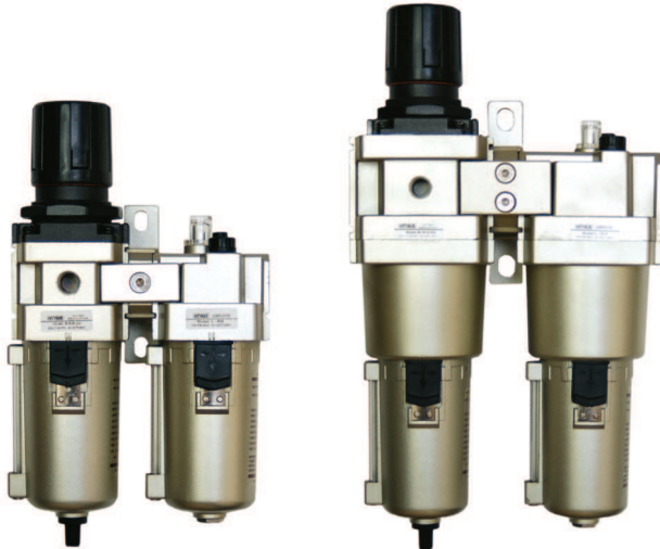
Fully assembled and complete with "T" Type Mounting Bracket.